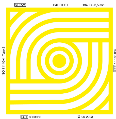
Unprocessed TEST Original color ( Yellow)