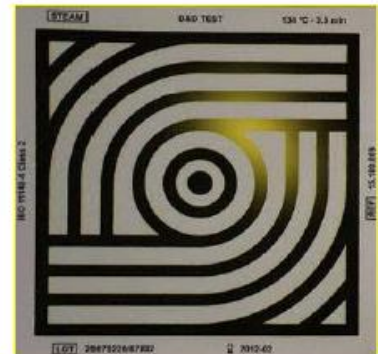
Fail Small air/gas collection X