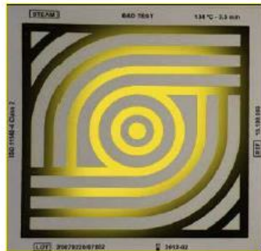
Fail Insufficient vacuum/penetration X